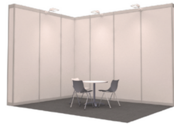
Option ALL IN BASIC 18m2

Both the ALL IN BASIC and ALL IN ADVANCED stands are included in the sponsorship price. If you prefer Free Space for a design stand, a special reduced price will be applied, having to hire a minimum area of 28m2.